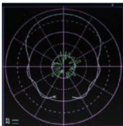
- Real time Radiation Pattern Display